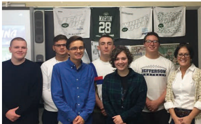
Sports & Entertainment Journalism Students

Were on the web! Visit us at www.jefftp.org , follow us on Twitter @jthsfalcons, & like us on Facebook