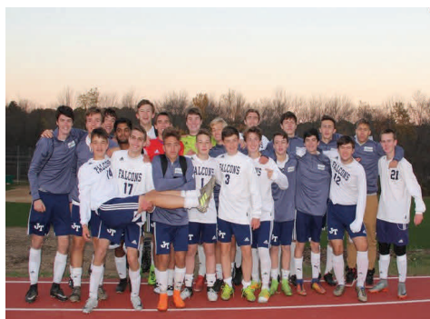
Boys Soccer Team

The Fall season is over and we had many successful campaigns. Most notably was our Boys' Varsity Soccer team that captured the first divisional title in the history of the program winning the NJAC American Division with a 6-2 record. Along the way, they set many records such as most goals scored, most shutouts, fewest goals allowed and most wins in program history. The Football team won their consolation state game beating a tough Wayne Valley team to finish there season at .500 (5-5). Girls' Soccer qualified for the state tournament as the 14th seed and lost a tough game to Glen Rock (#3 seed) in a sudden death shootout. They had a very competitive campaign. Girls' Cross Country