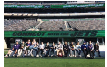
Sports & Entertainment Students enjoy a field trip to Met Life Stadium

All sports equipment is due by December 15. This is a two week-long collection that will be held in the high school. The items will be given to families in local areas. Please help by spreading your love of a sport with a needy family this holiday season.